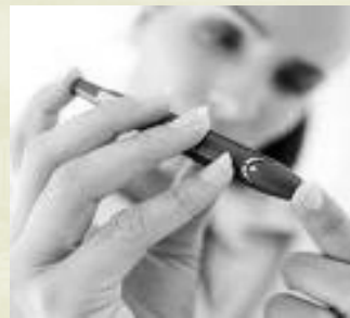
Treatment for Gum Disease May reduce Costs for Diabetics

This study gives more credence to the idea that it's essential for people with diabetes to maintain proper care on their gums. This is done by regular visits to the dentist or periodontist. They can ensure better health and save money by doing so. This study was done over a three-year period from 2006 through 2008. More than 46,000 people were considered in the study